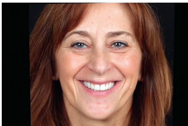
Figure 6. Trial restorations to evaluate smile design and dental midline orientation following facial flow rather than facial midline.