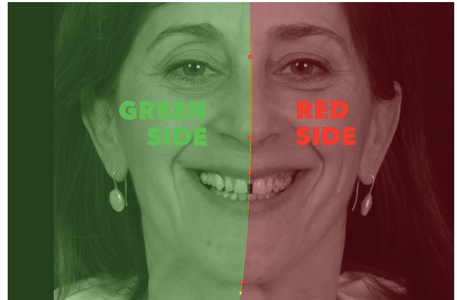
Figure 3. Facial flow directional movement points to right or “green” side.

Discrepancies must be evaluated to avoid under- or overtreatment. Thus, the new vertical reference for facially driven esthetic treatment should be the FFL. All FF structures, glabella, nose bridge, philtrum, and chin, are located in the center of the face and define a large line of force, which has an important effect on facial balance. The authors believe that by connecting the dots between these landmarks, starting from the natural head position, clinicians can define the FF of their patients to better understand the disposition and organization of facial structures and to plan in a more predictable, esthetic, and functional way. 26,27 The authors have observed that most faces present an asymmetrical pattern, where facial structures such as nose and chin usually point to the same side (Fig. 2). If clinicians are changing somebody’s smile and are not planning to make facial transformations (plastic surgery or orthognathic or orthopedic