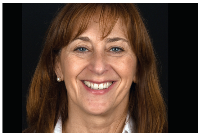
Figure 7. Definitive restorations respecting facial flow.

changes from the initial diagnostic waxing, the teeth were minimally prepared, and ceramic veneers (from the maxillary right lateral incisor to the maxillary left first molar) and a ceramic fixed partial prosthesis (from the maxillary right canine to the maxillary right first molar) were bonded (Fig. 7).